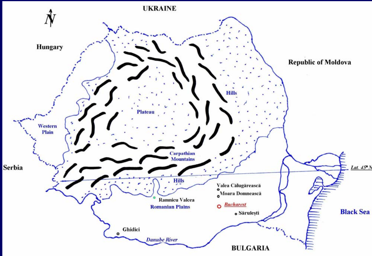
Fig. 1. The main relief forms in Romania.