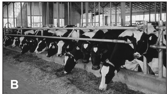
Figure 1. Picture of a headlock (A) and post-and-rail (B) feed barrier.

Each group was then exposed to four feed bunk space treatments (0.21, 0.41, 0.61 (industry standard), and 0.81 m/cow, corresponding to 0.33, 0.67, 1.00, and 1.33 headlocks/cow), in four successive 10-d treatment periods. After these periods, the barriers were switched between groups and the four bunk space treatments were repeated.